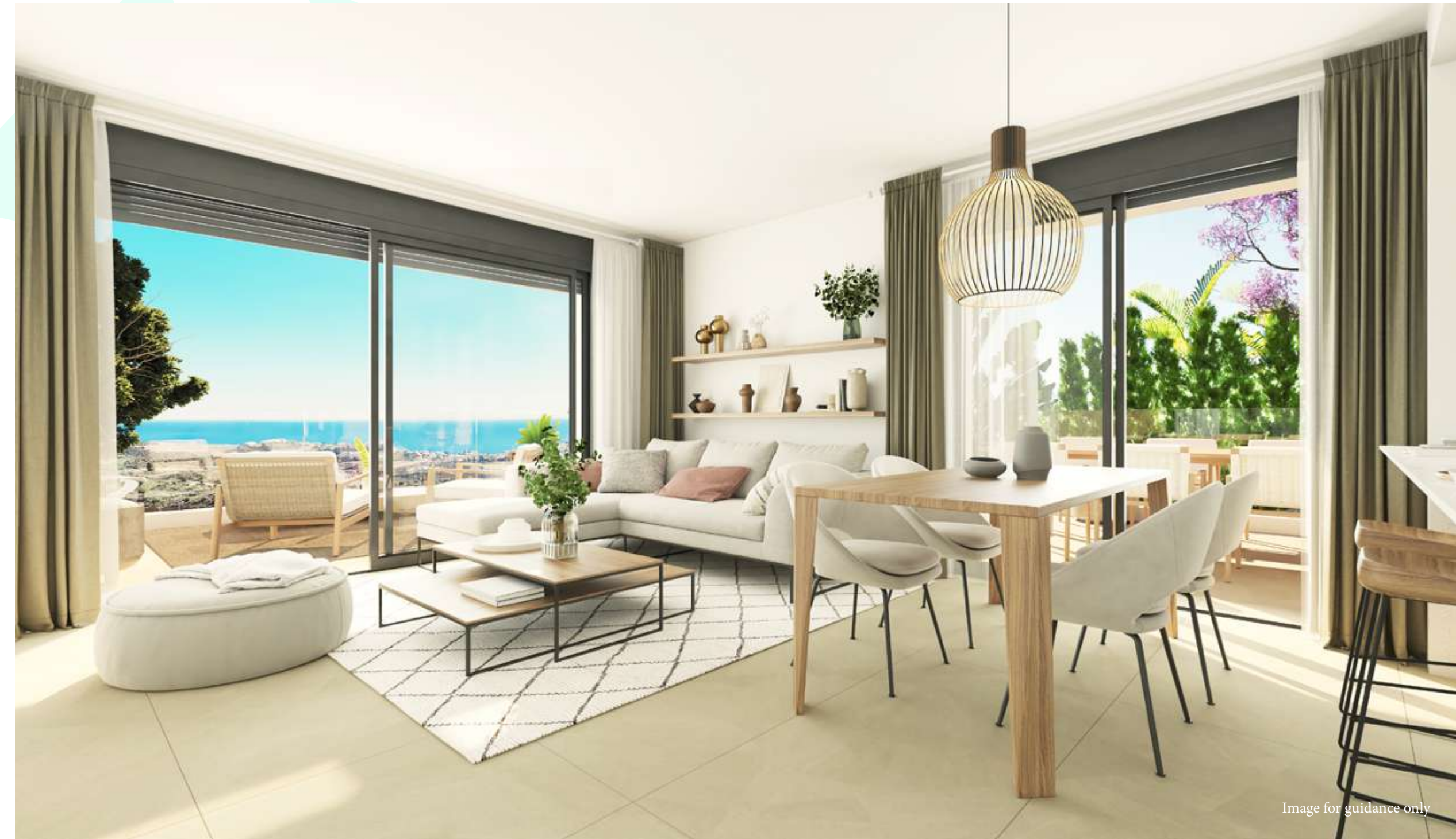
Image for guidance only

The generously proportioned two and three-bedroom apartments are spaciouly arranged in low-rise blocks of just four floors, with delightful manicured communal gardens winding between the residences.